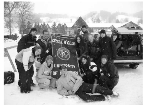
Aren't we just the coolest?

The wake up call was at 7:30 then it was off to the ever-extensive continental breakfast at 8:00, complete with two types of bagels, muffins and juice. Needless to say we weren't too impressed, but, never the less, we were